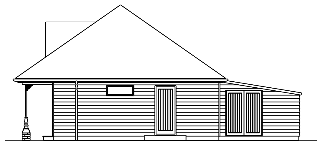
NORTH ELEVATION - PROPOSED